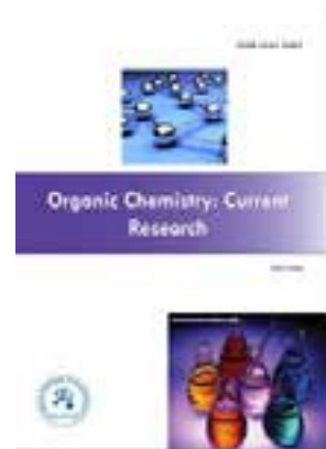
Organic Chemistry: Current Research