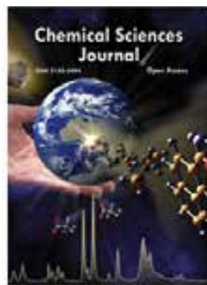
Chemical Sciences Journal